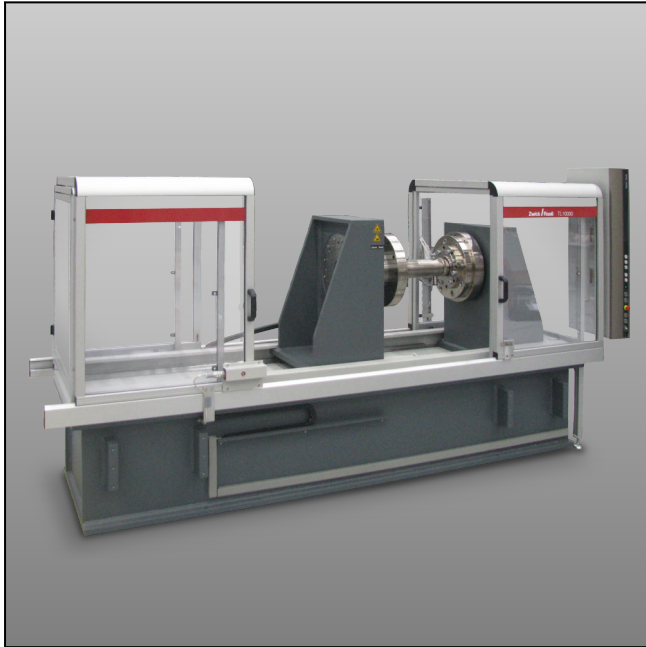
TorsionLine torsion testing machine with testControl II