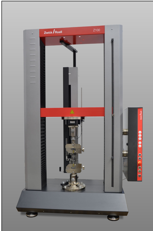
Long travel extensometers specially designed for ProLine testing systems